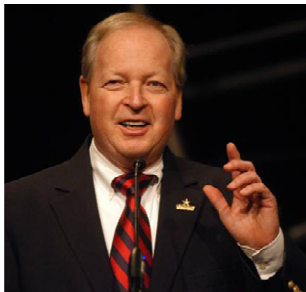
Nelson Burton Jr. at 2009 USBC Ceremonies