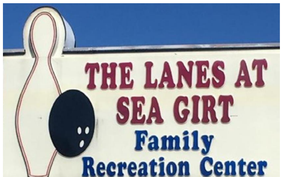
This massive road sign has greeted bowlers since the name change in 1995