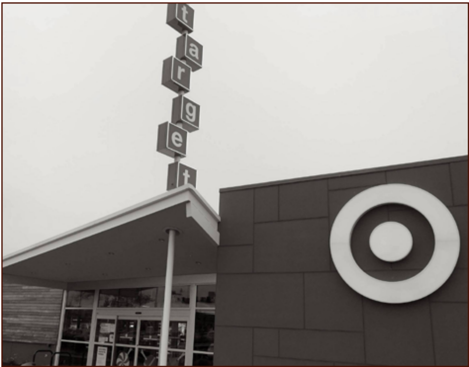
Pro 300 Lanes in Portland, Oregon, closed in 2017, and is now occupied by Target Stores. The storied building was saved, and features underground parking -- a definite plus in this “waterlogged” city.