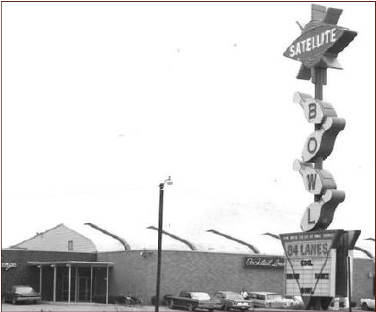
The 84 lane Satellite Bowl in Dearborn Heights, Michigan, was demolished to make room for a new Home Depot in 1994