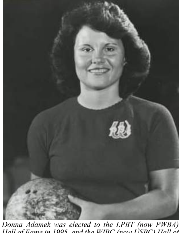
Hall of Fame in 1995, and the WIBC (now USBC) Hall of Fame a year later.